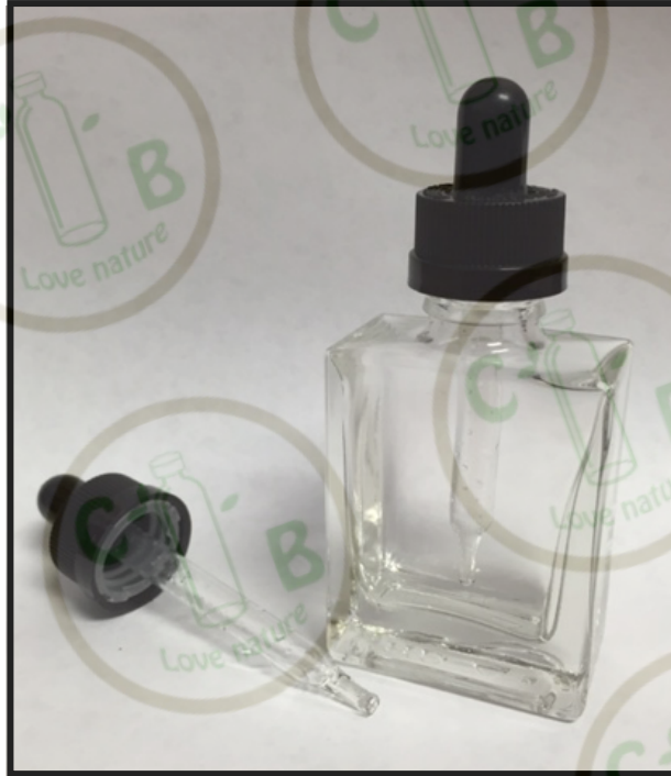
PHOTO: Glass Dropper Bottle